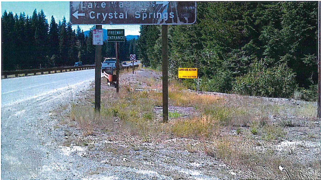
I-90 Stampede Pass Exit 62 West bound On-ramp