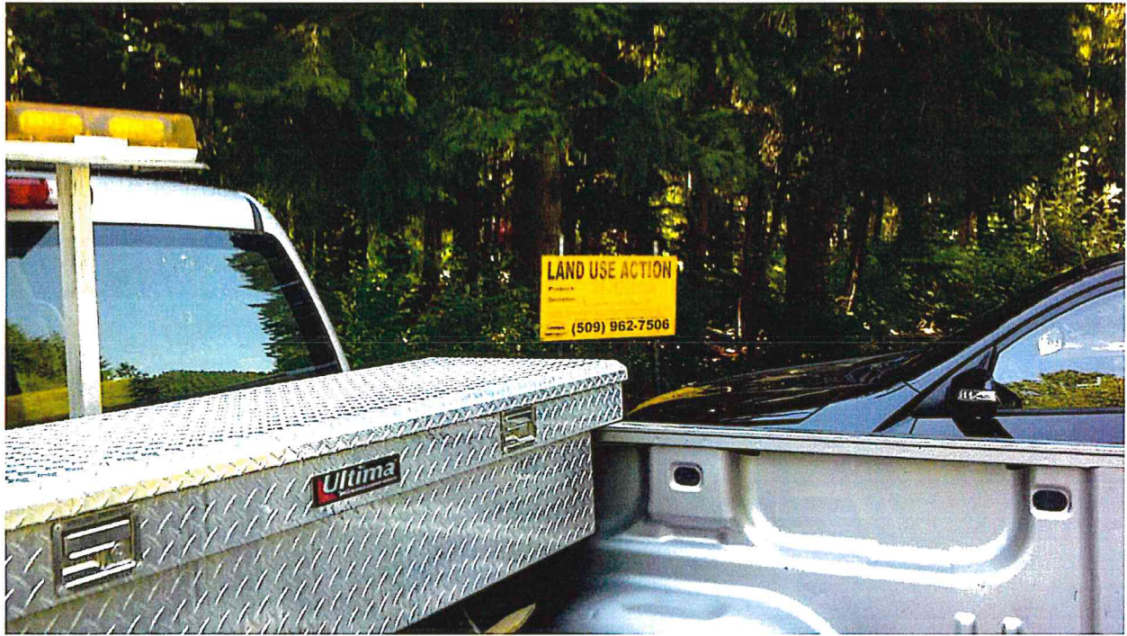
East Bound Price Creek Interim Rest Area MP 61.5