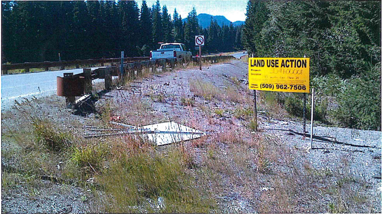
I-90 Stampede Pass Exit 62 West bound On-ramp