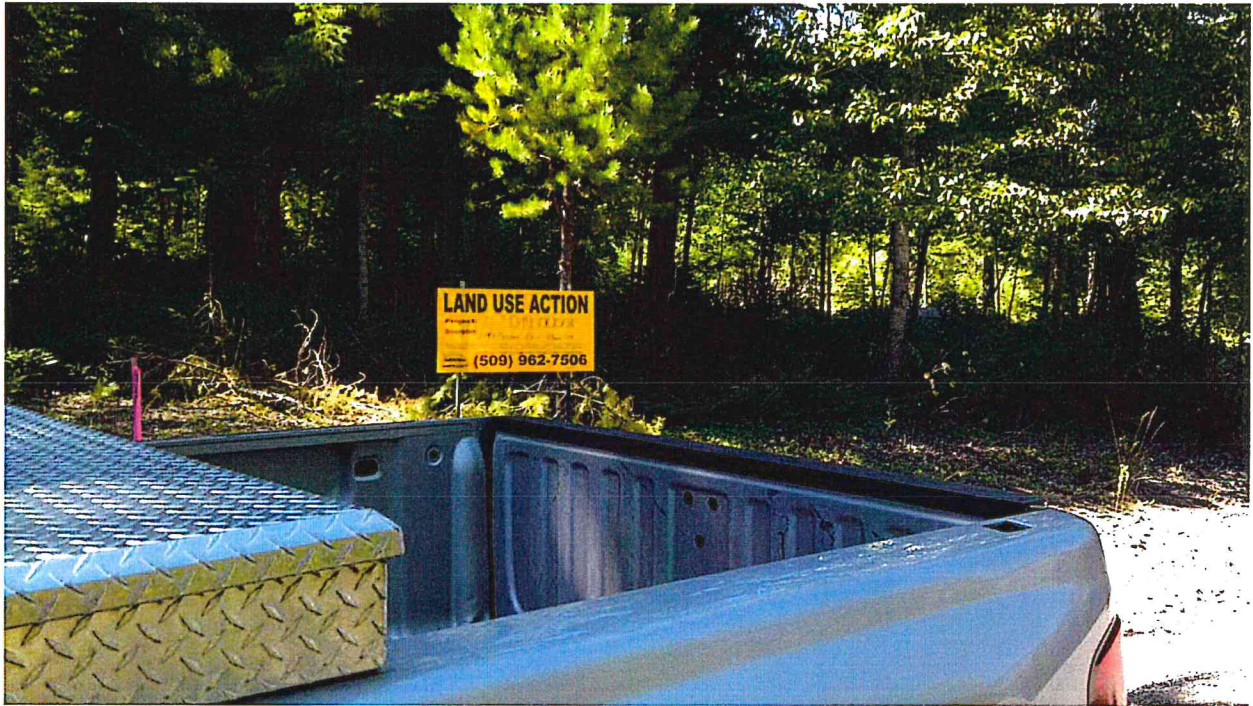
WSDOT property facing Sparks Road west of Easton between east bound and west bound lanes of I-90