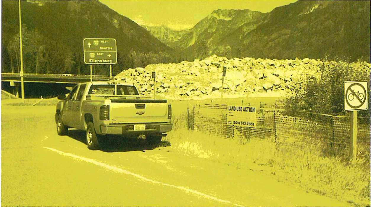
I-90 Hyak East Bound On-ramp MP 55

Four (4) KC Public Notice signs placed by Mark Reynolds the afternoon of August 7, 2014 on two (2) steel t-rods, connected by four (4) metal wires per sign.