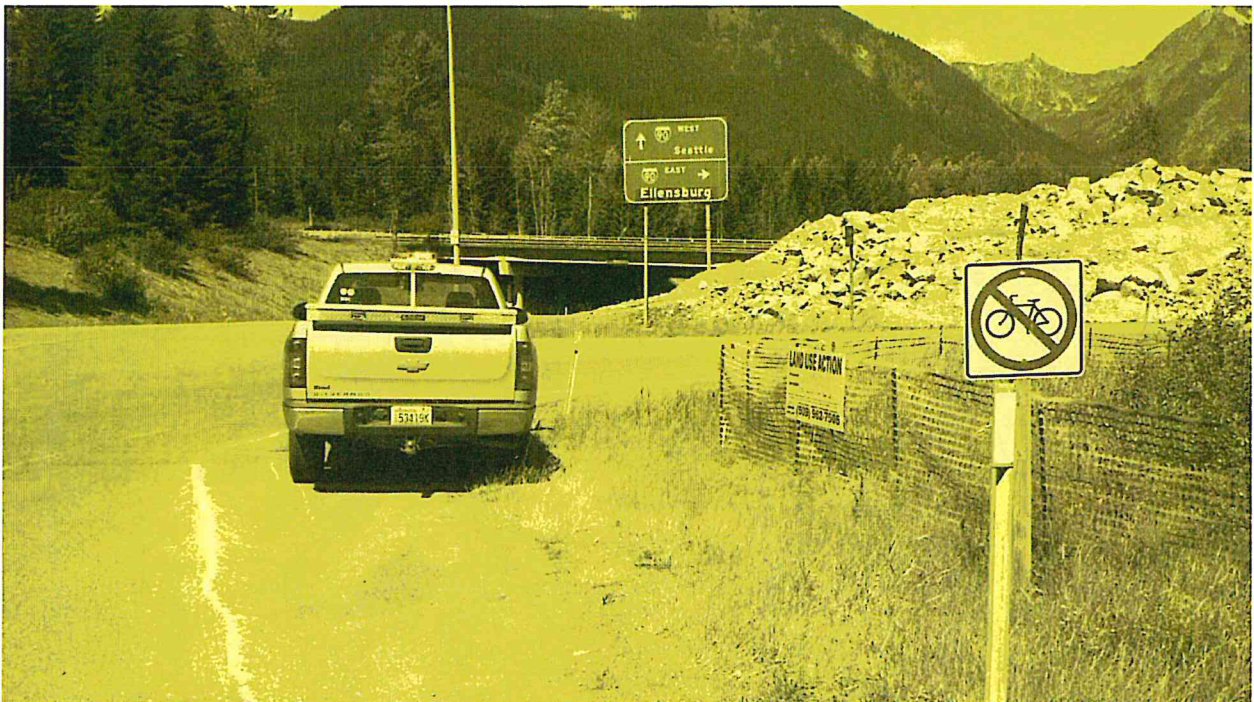
I-90 Hyak East Bound On-ramp MP 55