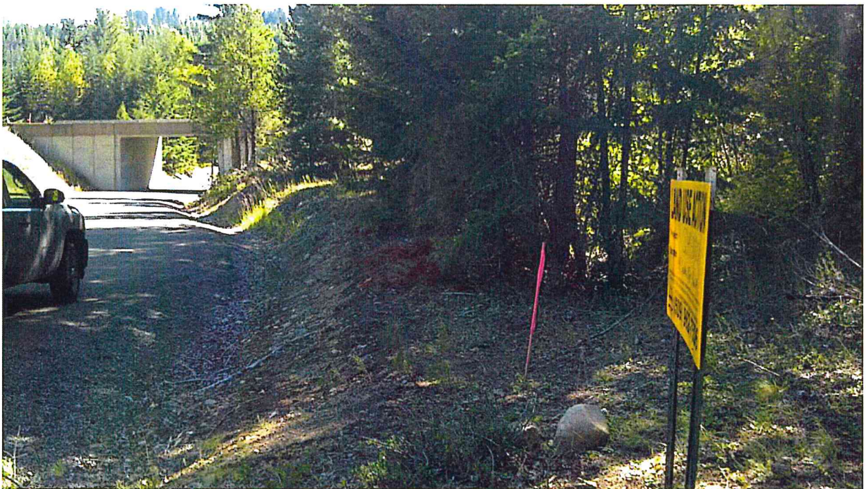
WSDOT property facing Sparks Road west of Easton between east bound and west bound lanes of I-90